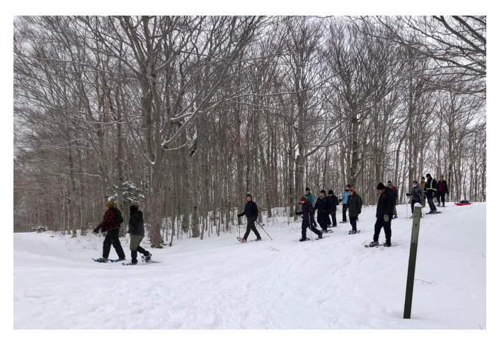
Participants of a hike at Valley View Provincial Park in Hampton, hosted by Annapolis County as part of the Winter Guided Walk series in January 2022.

"I enjoy the challenge to collect all the badges"