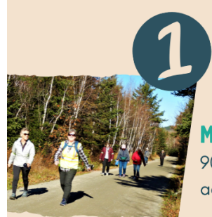
MORE ACTIVE 90.91% wanted to be more active

We surveyed NS Walks participants and asked them why they joined. Here are their top 3 reasons: