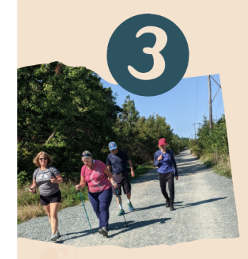
BETTER HEALTH 51.52% wanted to improve their health

Joining an NS Walks group can offer these benefits and more! #JoinTheMovement by visiting www.nswalks.ca