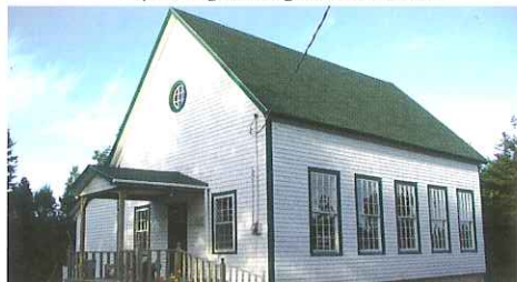
Cape George Heritage School Museum

sized model of a bluefin tuna. Prominently displayed is an antique Fresnal lighthouse lens, which is an exact match to the one originally used at the nearby Cape George Point Lighthouse.